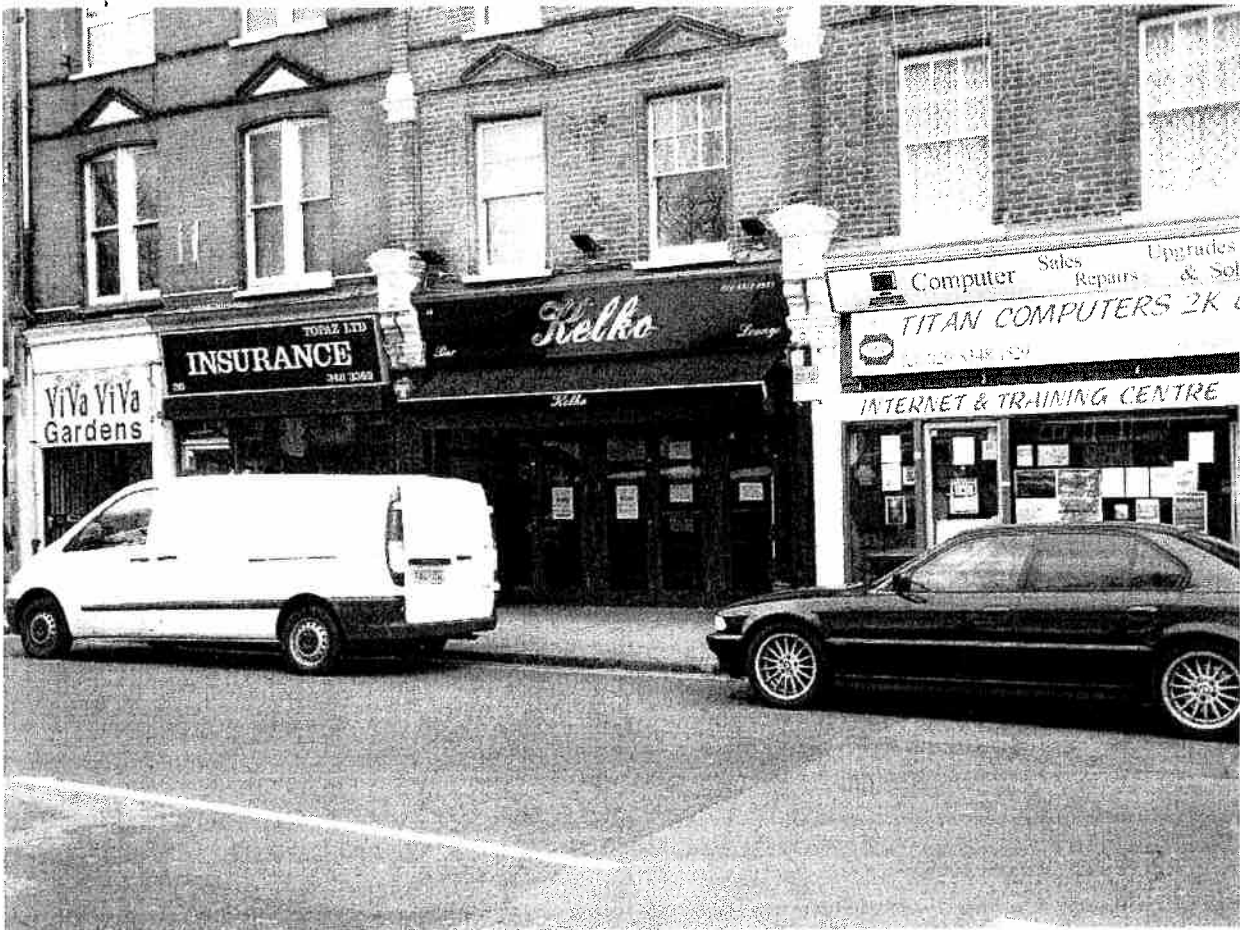
View of premises from across the road showing residential rooms above premises.